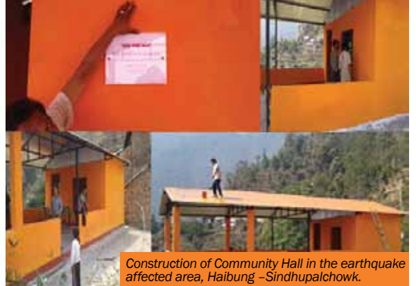
Construction of Community Hall in the earthquake affected area, Haibung –Sindhupalchowk.