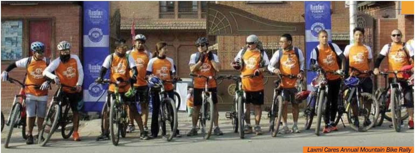
Laxmi Cares Annual Mountain Bike Rally

A Social Initiative by Laxmi Bank Employees