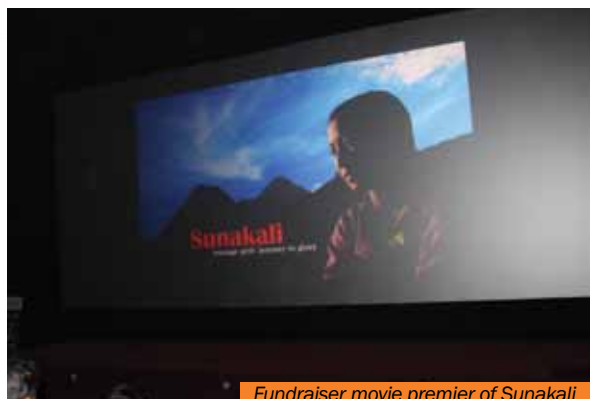
Fundraiser movie premier of Sunakali